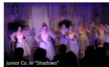
Junior Co. in "Shadows"